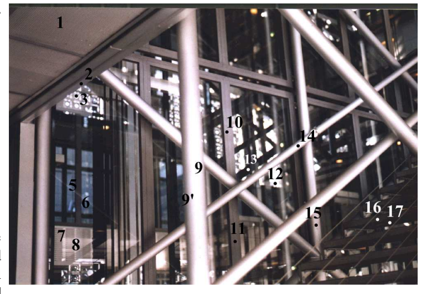
Fig. 3 - Point A, towards the middle of the space

This field of vision is made of several glazed surfaces, with the space for the lifts, the transparent lifts them-selves and the exterior north-east envelop of this part of the building. Many images of the facade are reflected these glazed on surfaces. Several